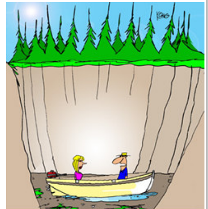
"This draught is taking all the fun out of our boating trip."