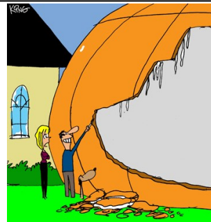
"Do you have to carve a life-size boat? That pumpkin cost a fortune!"