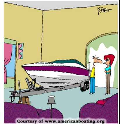
"I don't understand why you're upset. It's only for the off-season."