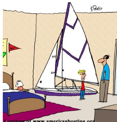
"Thanks for grounding me to my room, dad. It gave me the time to design and build my own sailboat."